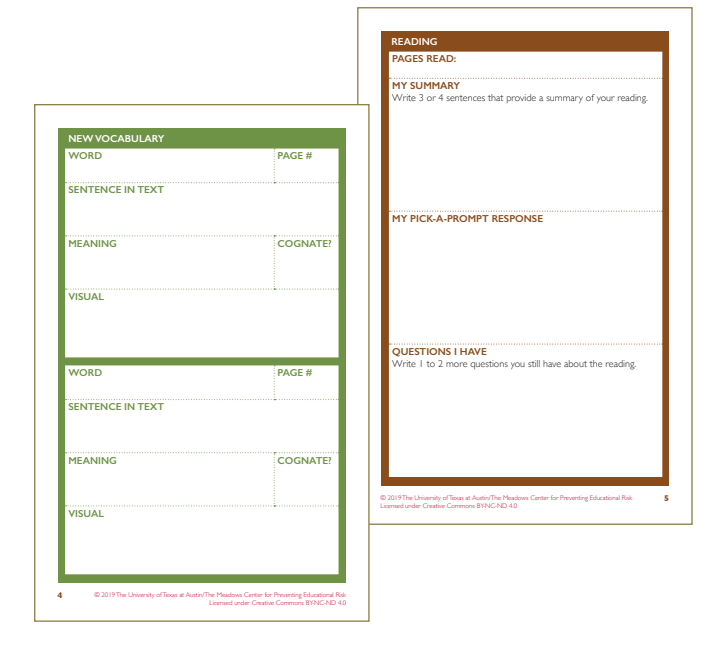
Figure 3. Sample pages from Project ELITE<sup>2</sup> Text Talks Workbook

In summary, the teacher integrates an oral language focus into her instruction by providing meaningful, structured opportunities for ELs to use and practice language while negotiating meaning from the text. The student workbook serves as tool for students to organize their thoughts and enhance their discussions. She incorporates CRP approaches into literacy instruction by validating and building on students' connections to text and language practices, providing support in extending their speaking to writing.