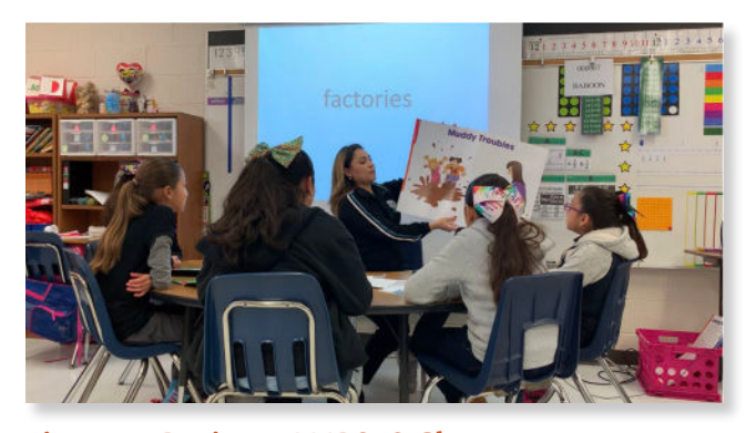
Figure 2. Project ELLIPSES Classroom

In this vignette, a Project ELLIPSES teacher provides evidence-based reading intervention to fourth-grade ELs.